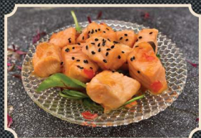
90. Caramel's salmon cubes 42 Salmon Cubes baked in caramel sauce