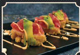
95. Brusquetta red tuna 38 Fresh tuna basil mint wasabi cream ananas mango sauce