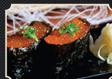
Caviar Avocado Nigiri