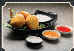
87. potatoes balls 33 Balls mashed potatoes crispy served with sweet chili sauce & chipotlet