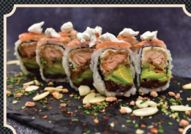
100. Baby Kanki 49 Salmon tempura avocado kampo cream cheese covered by salmon sired peanuts spicy mayonnaise and terriaky