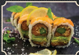
98. Lemon roll 48 Spicy salmon avocado asparagus covered by raw salmon served with spicy mayonnaise basil lemon wedge rough salt