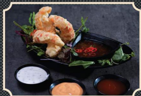
89. Shrimps crispy (kosher) 44 Surimi served with chipotlet garlic mayonnaise sweet chili