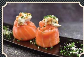
92. Nigiri special caviar / limon/ fromage/ crunch baked (peanut) 38 Nigiri tartar salmon sired with asiatic sauce (2 pieces)