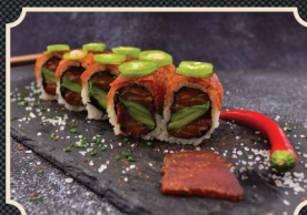
97. Butargua roll 59 Salmon avocado dried tomatoes covered by butargua hot pepper spicy mayonnaise green onion