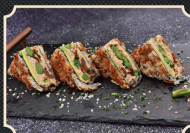
104. Sandwich Italian tuna mayonnaise 49 Tuna mayonnaise avocado dried tomato calamari olives asparagus covered sweet potatoes crispy rough salt