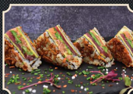
103. sandwich mix fish 49 Red tuna salmon yuzu asparagus avocado mayonnaise chili covered sweet potatoes crispy