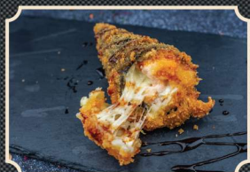
88. Crispy cheese cone 29 Cone with salmon shitaki and mix cheese