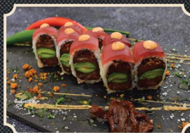
99. Chipotlet roll 56 Salmon avocado chipotlet shitaki asparagus covered by red tuna and chipotlet sauce