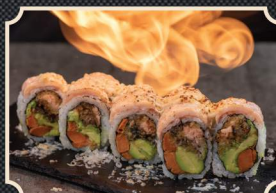
102. Sushi grill 48 Salmon skin avocado asparagus kampo covered by salmon grill spicy mayonnaise terriaky green onion and peanut