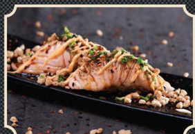
93. Nigiri grill 29 Nigiri salmon sired served with hot terriaky sauce spicy mayonnaise green onion and peanut (2 pieces)