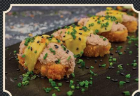
94. Nigiri crispy tuna mayonnaise 38 4 pieces rice crispy tuna mayonnaise on the top avocado green onion end asiatic sauce