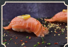
91. nigiri Mexican salmon/yellowtail 29 Nigiri salmon/ yellowtail sired on the top spicy japan sauce lemon wedge spicy mayonnaise rough salt (2pieces)