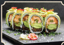
101. Mexican cook salmon 49 Salmon tempura avocado shitaki green onions asparagus covered avocado lemon wedge spicy mayonnaise rough salt