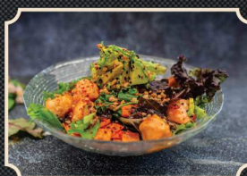
96. Asiatic salad salmon caramel 54 Baby salad crispy Sweet potatoes avocado peanuts Green onion cubes salmon cooked in caramel sauce