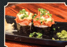
Red Tuna Nigiri